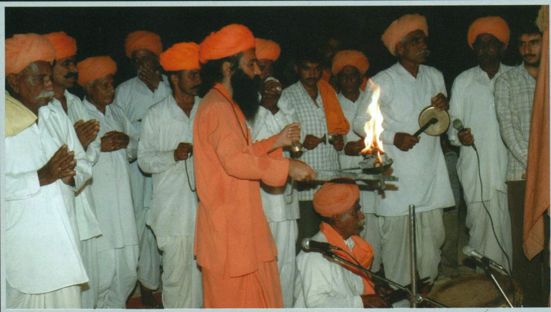
Preparations being made before lighting the logs for the bed of burning charcoals.

“O Creator of the Universe! You are omni present, the Earth is just a pedestal for your huge form and the Sun, the Moon and the Planets are your head; while praying whole heartedly we begin our ' havan ' (the holy performance).”